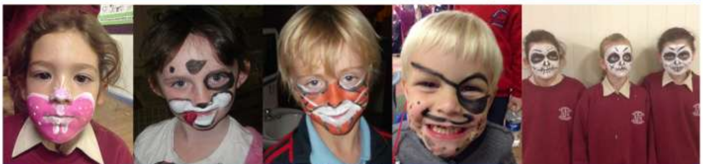
Lots of face painting fun!