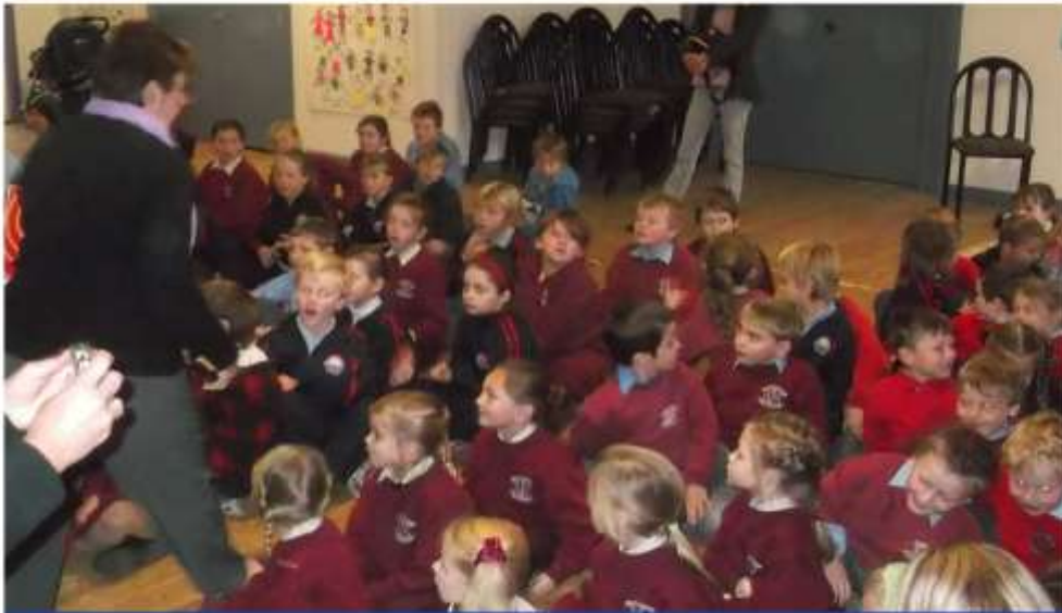
Waiting for the show to begin

This month we were very excited to have all the children from Eugowra Public School and St Joseph's School, join us for the National Simultaneous Storytime 2013. This years book was called The Wrong Book, which was not only read out to all of us but acted out as well by the staff at St Joseph's. We all got to read various other books too, do some fun activities and even have a jump on a very wet jumping castle!