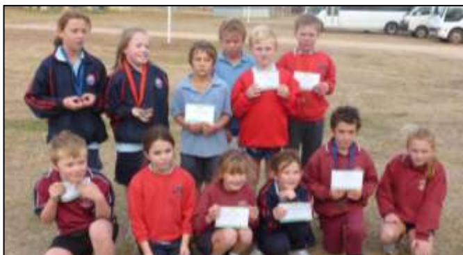
Junior Champions and age group winners

Congratulations to all our runners/walkers for participating in the Cross Country on Friday 17th. Well done to all the age group winners - all the children did very well. Thank you parents for helping out with the time keeping and organising.