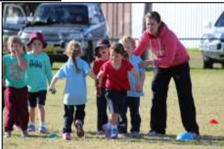
Sub Junior Girls running the relay