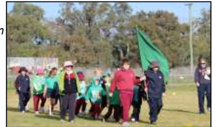
Green House won the March Past