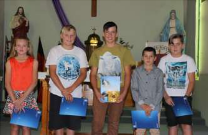
Eugowra Public School Year 6