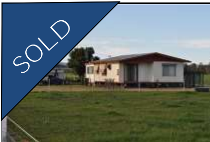
'Rebel Lodge' EUGOWRA

CONTACT: MICHELLE CHENEY 51 NANIMA ST EUGOWRA NSW 2806 PHONE (BH) 6859 2231 (AH) 6859 2819 MOBILE: 0414 815 479